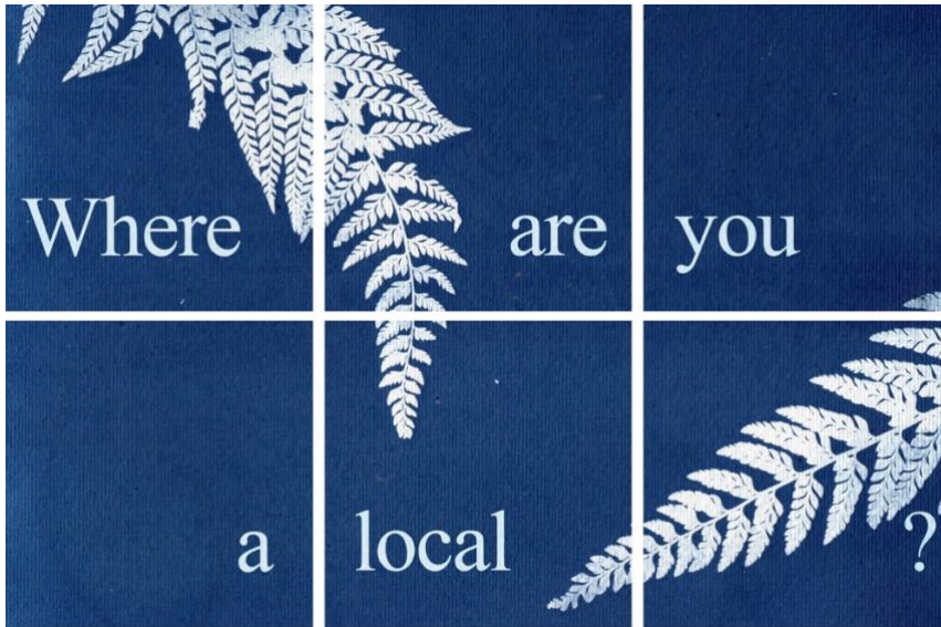
Figure 5 © Emma Lambert