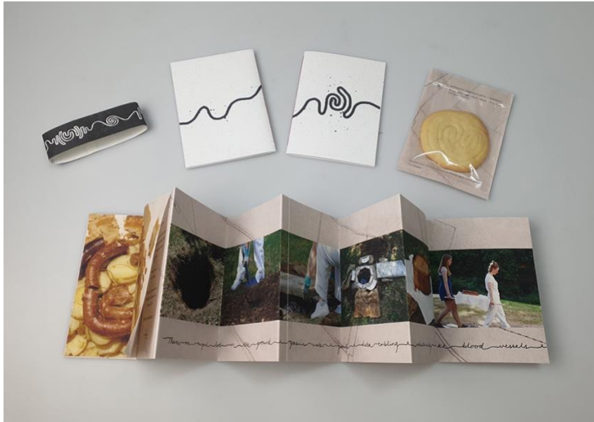
Figure 4 © Amanda Couch